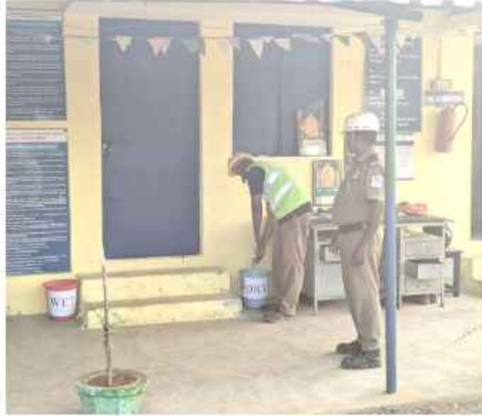
Garbage Collection & Segregation