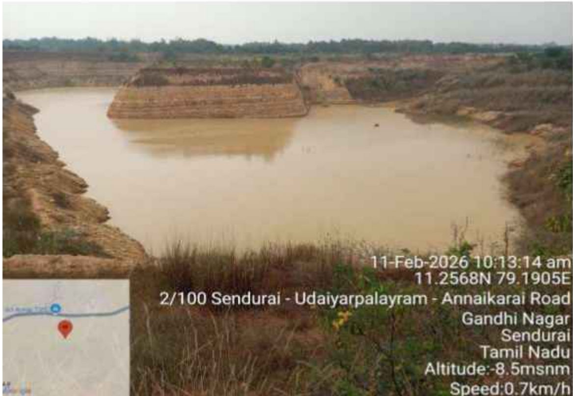
Rainwater Storage in Mines Pit